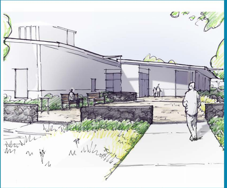
Administration Building Courtyard