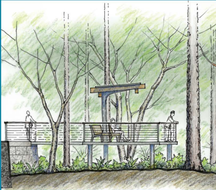
Forest Viewing Platform