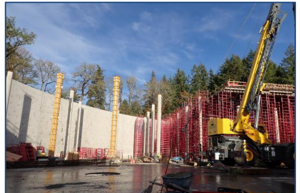
Each storage tank will hold 15 million gallons of water.

Two 15-million-gallon water storage tanks will be built near the SW Grabhorn Road and SW Stonecreek Drive intersection. Construction of the easternmost water storage tank is being done in coordination with the PLM_5.3 project. The westerly water tank construction has been deferred to approximately 2035.