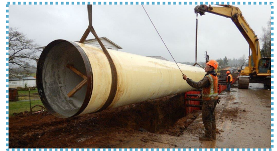
This segment of the pipeline is approximately 3.75 miles long and will traverse unincorporated Washington County.

Scholls Ferry Area Pipeline Project (PLM_5.3): This segment of the pipeline includes approximately 20,000 linear feet of 66-inch diameter, welded steel pipe. The pipeline alignment begins near the intersection of SW Tile Flat and SW Grabhorn Roads, to connect to the recently installed PLM_5.2 pipeline. The pipeline alignment moves north following Grabhorn Road to the future water storage tanks at the intersection of SW Grabhorn and SW Stonecreek Drive. The pipeline alignment then travels west on private property until it reaches the existing Bonneville Power Administration (BPA) corridor where it will move north following the BPA corridor to SW Farmington Road. North of Farmington Road, the pipeline alignment is within a potential future Cornelius Pass Road corridor through private property where it will connect to the South Hillsboro Pipeline Project (PLW_1.0), which is currently under construction and is anticipated to be complete in 2022.