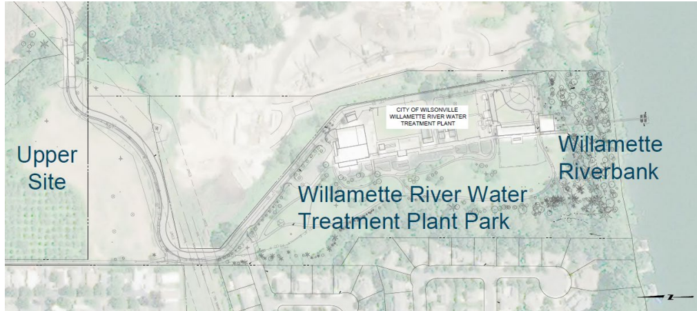
Raw Water Facilities Layout

four years. Improvements include an improved pump station, a seismically reinforced Willamette Riverbank, increased water intake capacity, a new electrical building, and a new raw water pipeline. Following is an update for the Park, Riverbank, and Upper Site.