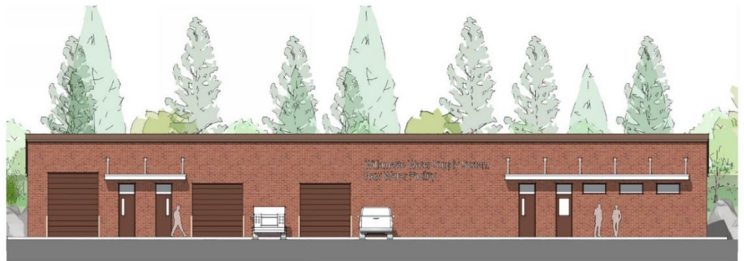
Upper Site Electrical Building