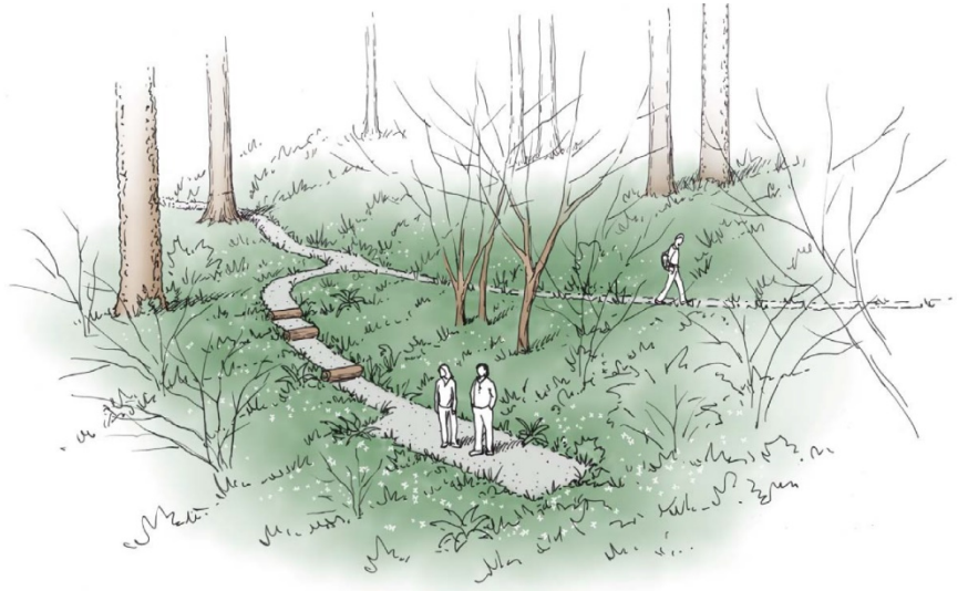
New Pedestrian Trail