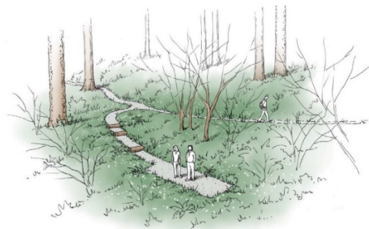
New Pedestrian Trail