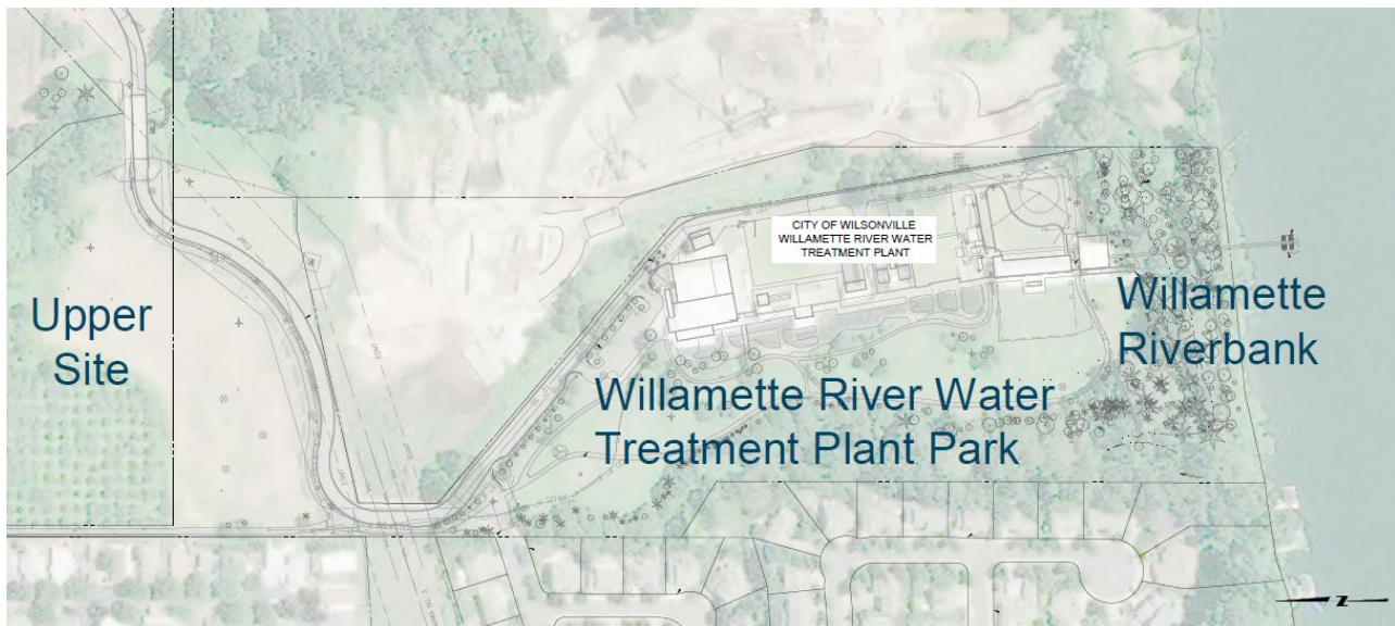
Raw Water Facilities Layout

In coordination with the City of Wilsonville, the Willamette Water Supply Program team plans to begin building improvements in and around the Willamette River Water Treatment Plant in Wilsonville in June 2020. Construction is expected to take four years. Improvements include an improved pump station, a seismically reinforced Willamette Riverbank, increased water intake capacity, a new electrical building, and a new raw water pipeline. Following is a description of the projects that will be built at the Park, Riverbank, and Upper Site.