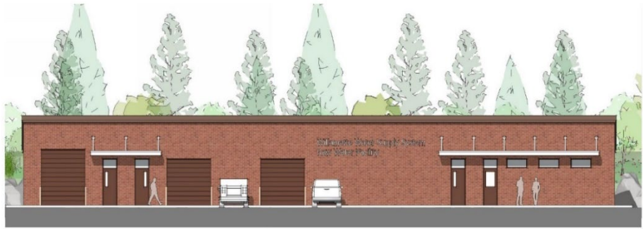
Upper Site Electrical Building